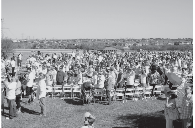
M.E.N.D.— Dallas: Families watching the 1,300 balloons released.

To view the DFW Walk Slideshow, scan the image or visit www.mend.org .